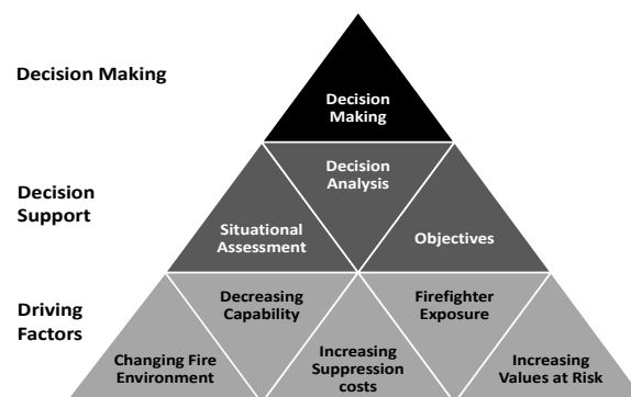
Fig. 1 Building blocks of wildland fire management decision making.

As a result of the emergence of disparate documentation and analysis processes with applicability limited to specific fire types and situations, a new method for wildfire decision documentation and analysis became an urgent goal for the U.S. fire management program. A new system, the Wildland Fire Decision Support System (WFDSS), was initiated