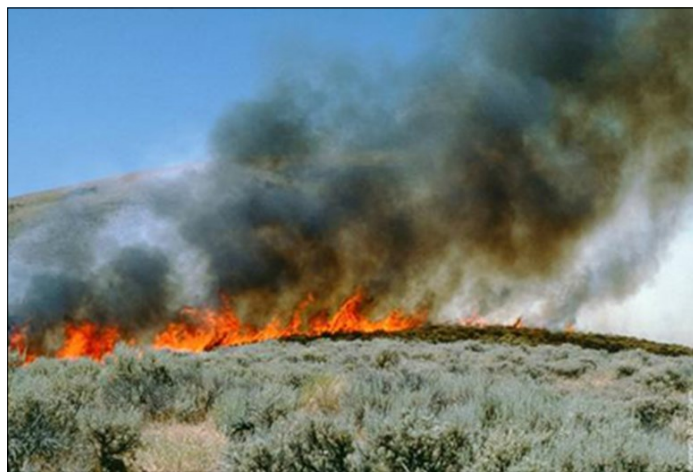
Figure 2. Prescribed fire in mountain big sagebrush steppe.

Contemporary Fire Ignitions. While American Indian influence on historical fire regimes is not fully understood due to a scarcity of historical records, it is clear that this influence was reduced by the end of the 1700s. Decreases in American Indian ignitions contributed to less frequent fire in sagebrush communities in some areas. However, intentional ignitions by early European-American settlers to increase grass production for livestock and clear land for farming were thought to exceed historical ignition rates of American Indians in some sagebrush communities. These “indiscriminate” burning practices led to policies during the early 1900s that discouraged ignitions and required fire suppression. Nonetheless, land managers continued to use prescribed fire and other manipulations from the 1930s through the 1970s—and to a lesser extent thereafter—to reduce sagebrush cover and density in an effort to increase