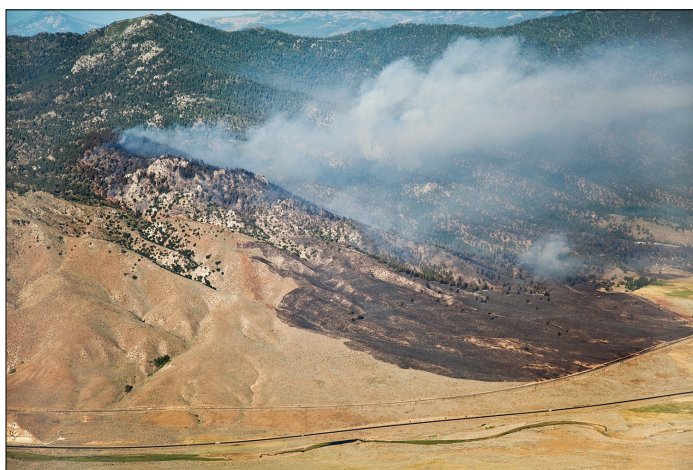
Figure 3. Fire spreading from a cheatgrass grassland (a site likely formerly dominated by Wyoming big sagebrush and perennial grasses) into a mountain big sagebrush community during the 2011 Constancia Fire, Long Valley, California.

The cover and density of conifers have increased in many mountain big sagebrush communities. As tree crowns increase in size, continuity of crown fuels increases and surface fuel abundance, continuity, and density decrease. These changes in fuel characteristics reduce the potential for surface fires burning under moderate weather conditions and increase the potential for high-intensity crown fires burning under extreme weather conditions. As prefire cover of native shrubs and herbs decreases and that of conifers increases, postfire recovery of mountain big sagebrush communities becomes slower and postfire invasion by cheatgrass becomes more likely.