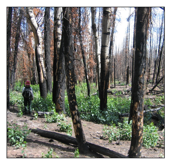
Figure 6. Patchy aspen regeneration two years following a prescribed fire conducted in high fuel loads on the BTNF. Fire effects were severe but aspen sprouting still occurred.

Aspen stem regeneration was variable following prescribed fire and/or cutting treatments, but generally density increased with burn severity and was greatest on sites with high pre-treatment aspen density. Treatment success was