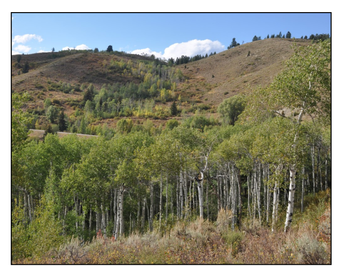
Figure 1. Aspen intermixed with sagebrush/grassland in a foothills location. Aspen is growing where there is sufficient moisture from springs and winter snowdrifts.

Though variations exist, two dominant functional aspen community types are commonly identified: stable and seral (Rogers et al. 2014; see Figure 2). Stable aspen functional forest types remain as aspen communities through time. These include aspen parklands, terrain-isolated aspen stands, and aspect- or elevation-limited aspen communities. A seral aspen community begins as an aspen community, but over time is replaced by conifer species. The seral aspen type is often seen in montane and boreal forests. For effective restoration, identifying the functional type and associated species is important because seral and stable aspen stands occupy different landscapes, have different disturbance histories, and often respond differently to changing conditions and disturbance events (Rogers et al. 2014). Subdivisions or "community aspen types" within these two dominant functional types, which depend on location and associated species, are described in Table 1.