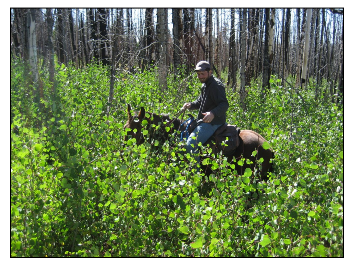
Figure 3. Prolific aspen sprouting a few years after an unplanned wildfire in mixed aspen and conifer forest (lodgepole pine, subalpine fir).

Given the variety of occupied sites, diversity of associated plant communities, and large geographic range of aspen, it is difficult to identify a single dominant fire regime or even a few most prevalent fire regimes (Shinneman et al. 2013). However, several statements apply to all aspen woodlands, regardless of their functional type. First, if a fire occurs within, or spreads into aspen stands, overstory aspen tree mortality is likely to occur regardless of fire intensity or flame height. Second, aspen stands are generally not highly flammable, so fires typically burn with low rates of spread and low intensities or fail to burn even when surrounding forests or shrublands burn. Third, where aspen does burn, the thin bark and low heat tolerance of aspen stems often results in nearly 100% aboveground aspen mortality. As a result, few trees survive with fire scars. Finally, aspen often sprouts prolifically following fires, though this may not be evident where rates of herbivory are high.