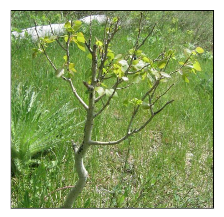
Figure 4. Browsed aspen in Grand Teton National Park 10 years after prescribed fire in an area with year-round elk use.

lier onset of conifer encroachment in seral aspen communities (Seager et al. 2013). The ungulate-aspen relationship is so strong that some have linked large elk populations to lower aspen recruitment (Rogers et al. 2015).