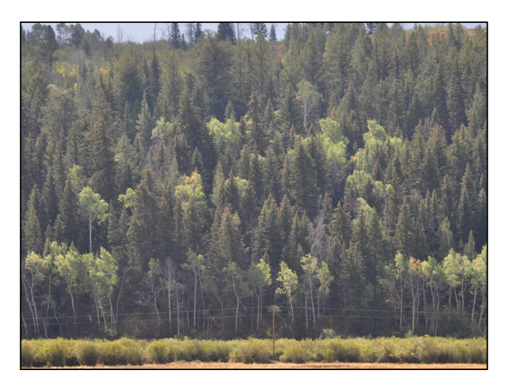
Figure 5. Conifer encroachment in an aspen stand as a result of a long fire-return interval on the BTNF.

Fire suppression across the western US has resulted in the conversion of many seral aspen stands to coniferdominated forests through gradual infilling (Rogers and Mittanck 2014). However, it is important to note that while fire suppression and land use have changed the fire frequency in many dry forests, there have been fewer effects of fire suppression on the fire frequency in cold, highelevation forests where the intervals between fires were historically much longer (Schoennagel et al. 2004). In seral aspen stands, competition between aspen and conifers negatively impacts aspen growth and increases overstory stem mortality more in older than in younger stands (Kaye et al. 2005; Calder and St. Clair 2012). Seral aspen stands can be replaced by conifers in the absence of disturbances as aspen stems age, but disturbances help stands resist conifer dominance by increasing the abundance of young stems in the absence of heavy herbivory.