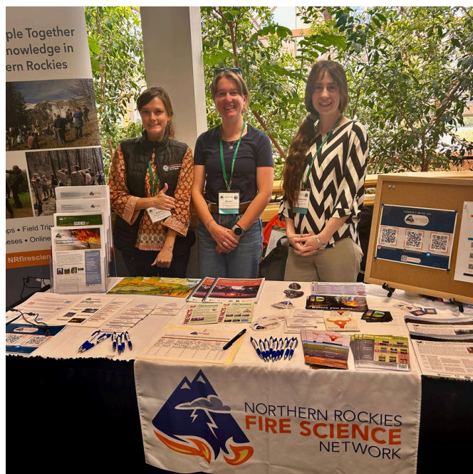
Representing the Fire Science Exchange Network at the Intertribal Timber Council Symposium in Missoula, MT

Finally, NRFSN attended a number of regional exhibits, reaching new groups and connecting with different audiences. In February, NRFSN was in Spokane, WA, for the 2025 Society for Range Management Annual Meeting. Having a presence at this event expanded recognition of fire topics beyond forested areas, which can often receive the majority of focus in this region. This year, the Intertribal Timber Council (ITC) held its annual meeting in the Northern Rockies region, and NRFSN attended this event for the first time. The ITC Symposium was a great opportunity to expand connectivity and build connections within the Tribal lands management audience. NRFSN also attended the Idaho Family Forest Landowners & Managers Conference in Moscow, ID. The audience of this event is primarily smaller family forest owners and managers, very different from the state and Federal managers that are often the focus when it comes to fire management. 🌱