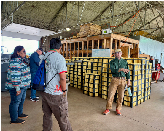
Touring the Confederated Salish and Kootenai Tribes Forestry Nursery as part of the Intertribal Timber Council Symposium

The Northern Rockies Fire Science Network (NRFSN) serves as a go-to resource for managers and scientists involved in fire and fuels management in the Northern Rockies. The NRFSN is funded by the Joint Fire Science Program and is one of 15 Fire Science Exchange Networks across the country. The NRFSN facilitates knowledge exchange by bringing people together to strengthen collaborations, synthesize science, and enhance science application around critical management issues.