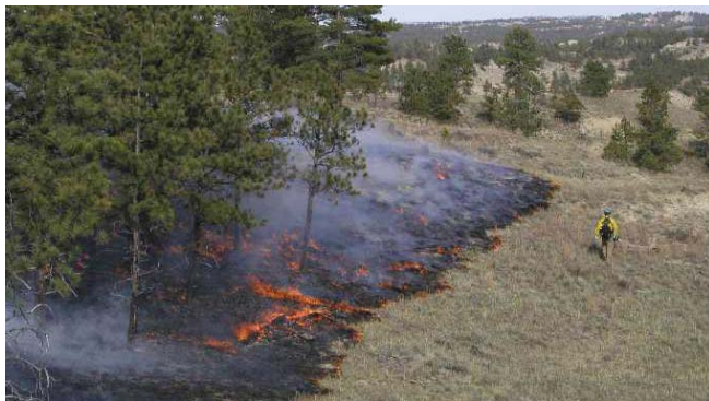
Test ignition for the HCross Prescribed Fire on April 22, 2003.

This is precisely what happened in the Missouri Breaks of eastern Montana when the Indian and Germaine lightning-sparked wildfires burned more than 100,000 acres. The two wildfires burned across areas which had previously been prescribed burned. But “pre-disturbance” data had not been collected before the outbreak of the wildfires.