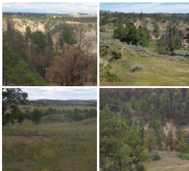
Photos documenting the variation in forest structure and burn severity throughout the study area; (top left) North Breaks prescribed fire and wildfire combined, (top right) South Breaks, (bottom left) HCross, and (bottom right) North Breaks prescribed fires.

But did it work? Did this ‘quick and efficient’ approach answer the original question: Did it make a difference in terms of management goals if the wildfire-burned land had been prescribed burned prior to the wildfire?