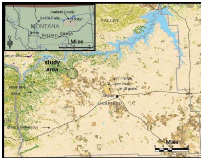
Map of the study area along the breaks of the Missouri River in eastern Montana. The circle shows where the photographs and data were obtained.

“We took all sorts of information on these sites including topography, slope, aspect, soil surface characteristics, trees per acre, tree diameter, and much more,” says Jain. “We picked sites adjacent to wildfire sites (no burn, “control” plots), prescribed burned sites, and sites that had both wildfire and prescribed burns. We selected our