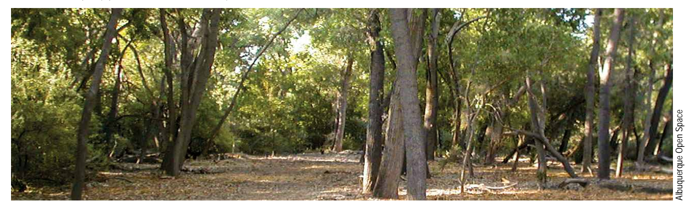
Treated bosque (riparian cottonwood forest).