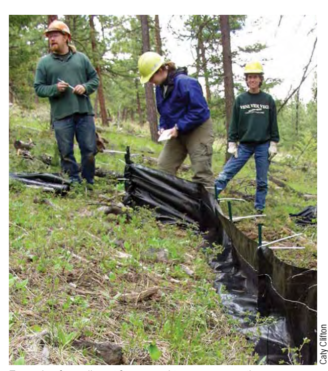
Example of a sediment fence used to measure postburn hillslope erosion.

the uplands and allowed into the riparian areas. They found no significant increases in erosion and sediment delivery associated with the burns. "One of the biggest concerns was the effect of erosion resulting from prescribed fire, and our work showed that we could allow fire into riparian areas under low severity and not have significant negative effects," Clifton says.