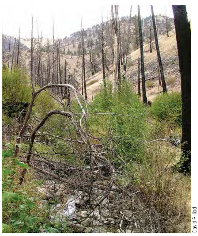
Cliff Creek, part of the Frank Church-River of No Return Wilderness in Idaho, burned in 2000 during the Diamond Peak Fire.

While the finding that prescribed fire in riparian areas could be beneficial opened the door to expanded riparian treatments, another important lesson is that