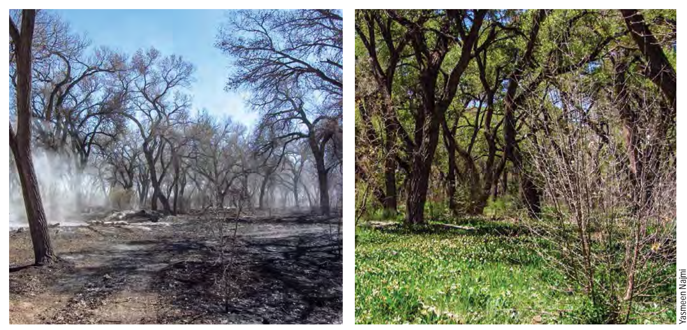
Bosque fuels reduction study sites in Bosque, New Mexico. Nonnative trees and excess dead and down wood were removed/treated in 2003. In March 2014, a fire burned through the site. The photo on the left was taken during mop up of the fire, and the photo on the right was taken about 3 months later. The fire burned lighter through native groundcover, where most of the trees survived. Since more than 10 years had passed since treatment, the mulch probably had a chance to significantly decompose. Therefore, the fire didn't burn as hot or long.

The Bosque del Apache National Wildlife Refuge straddles the Rio Grande south of the town of Socorro, New Mexico, on the edge of the Chihuahuan Desert. The refuge contains one of the healthiest, most extensive remaining bosques, or riparian cottonwood forests, left in the Southwest. This bosque provides critical habitat for many of the birds, mammals, insects, spiders,