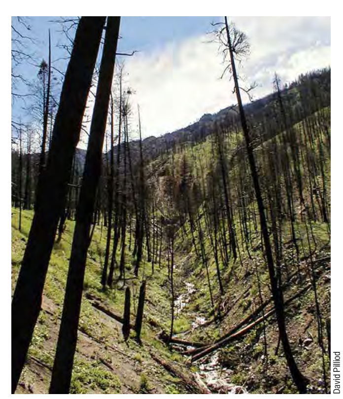
Pioneer Creek, part of the Frank Church-River of No Return Wilderness in Idaho, burned in 2000 during the Diamond Peak Fire.

For all the other factors studied, researchers found minimal effect of fuels treatment in buffered and unbuffered riparian areas. Summer stream flow, water quality, and recruitment of large woody debris for habitat were not significantly affected by treatments in riparian areas. Similarly, macroinvertebrate communities were not affected by treatments. And, little difference was found in bird richness or nesting success in riparian sites.