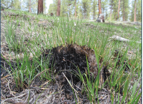
Native bunchgrass Idaho fescue (Festuca idahoensis) sprouts from the surviving root crown following a reburn.

Not being able to better mimic historical wildfire is further complicated by the ways that environmental changes, extended