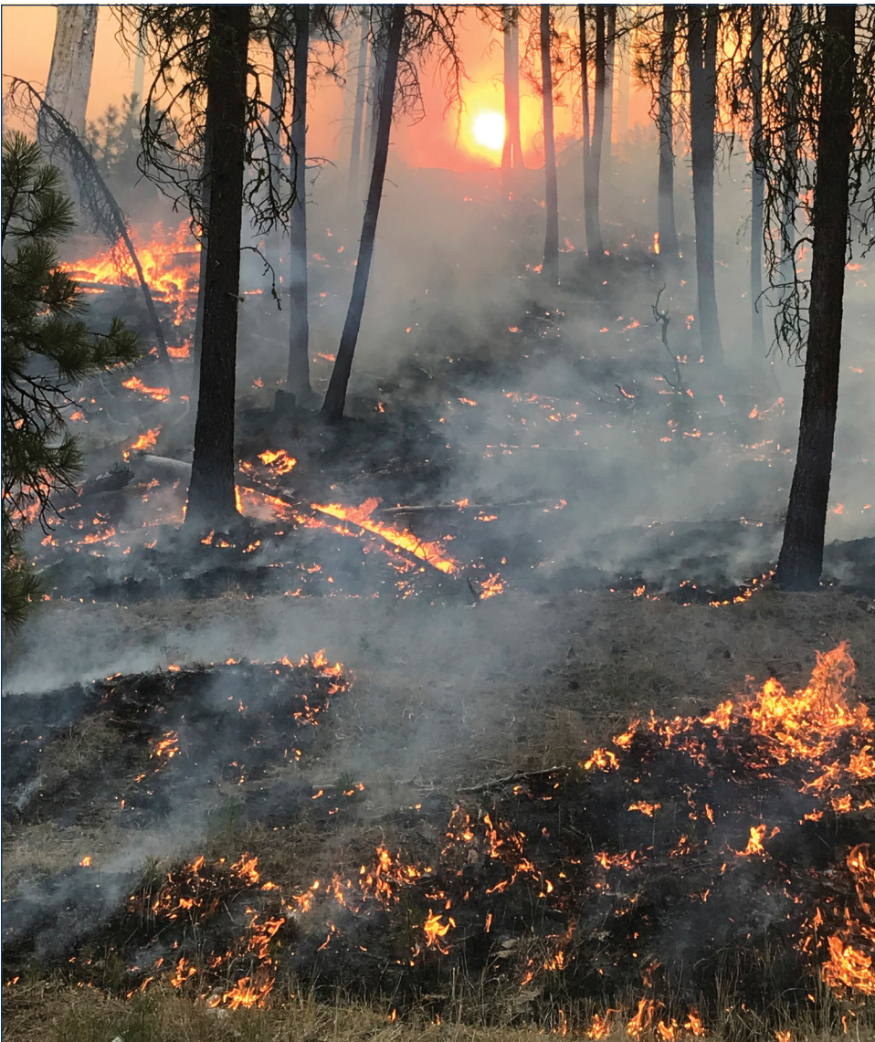
The most recent 5-year reburn, fall 2018, was completed several weeks earlier in the season and burned hotter than the previous fires in this study. Although follow-up fieldwork is not planned, new data collection and analysis could reveal if these factors affect the response of the understory vegetation.

"Our results show that we may need to think about and apply prescribed burning differently, as well as better integrate it with weed management," Kerns says. "And they're consistent with a growing number of recent studies that show neutral responses to prescribed burns, particularly for native perennial plant groups targeted for restoration."