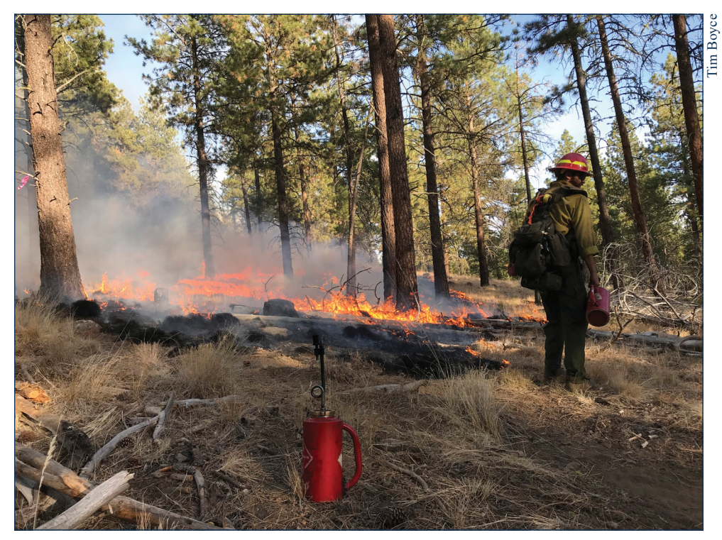
This prescribed burn in the Malheur National Forest in fall 2018 was conducted as part of a study examining the effects of burn season and frequency of prescribed burns on native and invasive plants.

"You can't see what you don't understand. But what you think you already understand, you'll fail to notice."