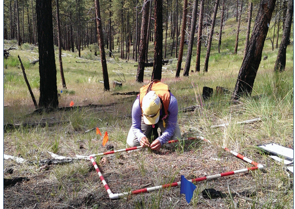
A member of the field crew collects plant data in a plot that was burned in the fall at 5-year intervals.

Burn frequency and intensity add to the complexity. Frequent use of fire in the same area is thought to favor species that can sprout from roots, have thick protective bark, or even require fire to release their seeds. However, the