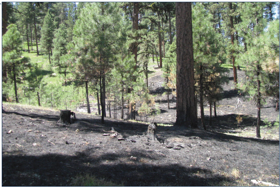
Fireline between a second 5-year-interval reburn and an unburned control stand. The experiment's design enabled the scientists to measure how different types of forest vegetation responded to repeated burns conducted in either spring or fall.

drought, past harvest practices, and livestock grazing may have left a mark on these dry forests and their understory vegetation. Ecological processes may have been interrupted in other ways as well. For example, some early-successional natives such as fireweed that are well adapted to fire may now lack a seed bank or be so reduced in number or vigor that they can't increase in abundance after a burn.