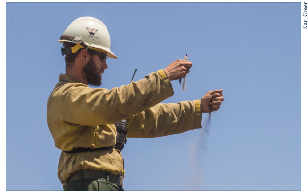
Measuring wind speed. Wind is a weather variable that can turn an ember into a wildfire. Knowing the wind direction and speed allows fire managers to effectively deploy resources or pull firefighters back from the line.

The meteorology community understood that weather conditions above the surface (above the height of an average person) influenced a wildfire, but this information wasn't easily shared with fire managers. Additionally, it was difficult to collect weather measurements above the surface. During the 1970s, launching a satellite was still a novelty. Today's handheld gadgets that record, transmit, and archive temperature, windspeed, and humidity data weren't even conceivable then because the technology and computing power hadn't been invented. If a meteorologist wanted to measure the air temperature above human height, they needed a tower or a weather balloon.