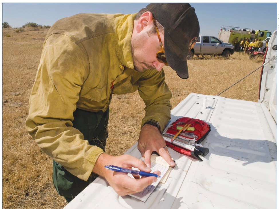
Taking field notes during a prescribed burn. Feedback from early users of the Hot-Dry-Windy Index has helped shape the tool's user interface.