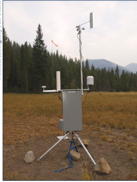
A remote, automatic weather station collects weather data during a fire. This information is incorporated in near-real time to the models that feed the Hot-Dry-Windy Index.

Because of his experience working with climatological datasets, Srock took the lead in identifying the datasets the new index would be built upon. For the real-time weather data, he chose the Global Ensemble Forecast System (GEFS) because it provides global ensemble forecast data and is familiar to the fire weather community. It also included 21 forecast possibilities, which provided a better estimation of future weather. "If all the possibilities peak or all of them are very low, you have more confidence of future weather conditions than if the possibilities are each all over the place," Srock explains.