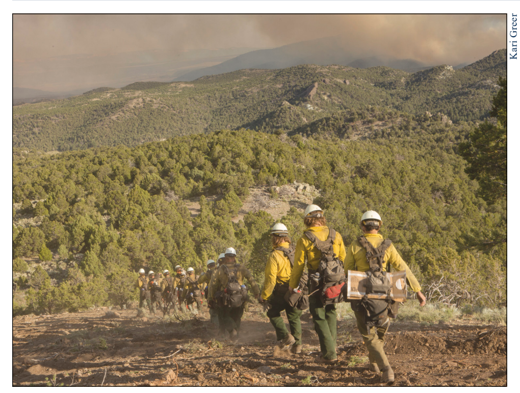
Firefighters hike toward the 2017 Brian Head Fire, Utah. Weather plays a crucial role in wildfire behavior. Fire meteorologists need tools such as the newly developed Hot-Dry-Windy Index to predict dangerous conditions. These forecasts help protect firefighters and help incident commanders strategically allocate firefighting resources.

"An ill wind that bloweth no man to good." -John Heywood, writer