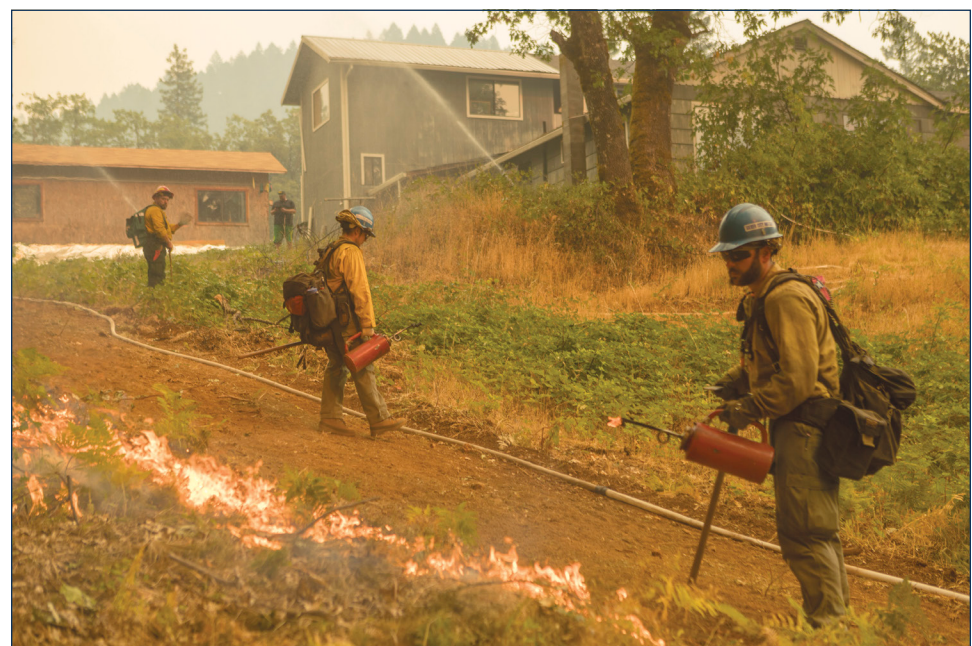
Firefighters carefully conduct a controlled burn around houses during the 2018 Taylor Creek and Klondike Fire on the Rogue-Siskiyou National Forest, Oregon. Accurate fire weather forecasts, which provide critical information for timing this type of activity.

Curtis considers the HDWI as a tool that looks at a broader scale of the region, and it signals when it's necessary to dig deeper into the meteorological data to determine what the weather will do.