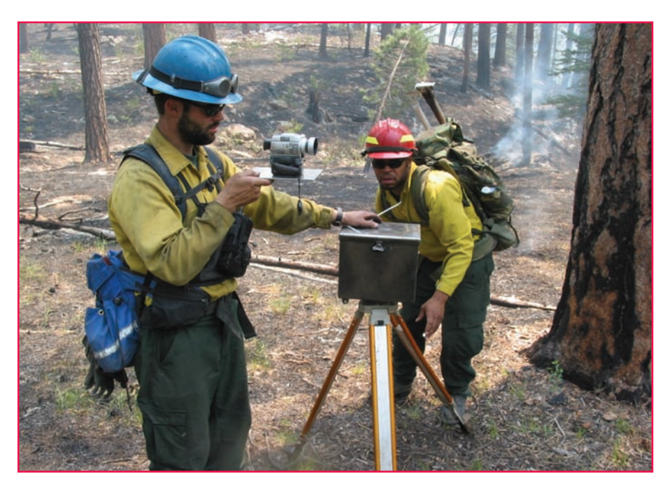
Fire researchers installing a video acquisition box.

The Fire Behavior Package (FBP) measures 11 inches (27