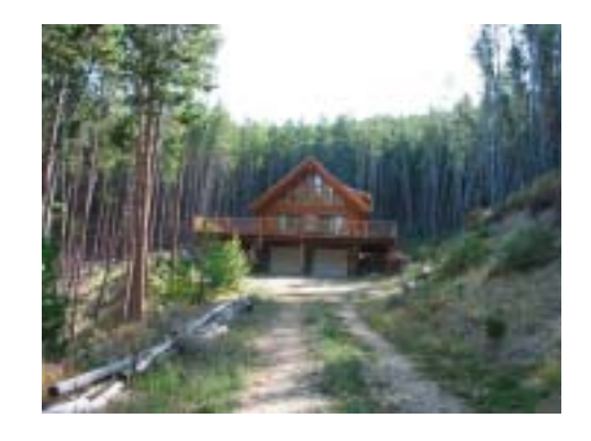
New regulations regarding development are meant to avoid access conditions like those shown on the left and quarantee access conditions like those shown on the right.