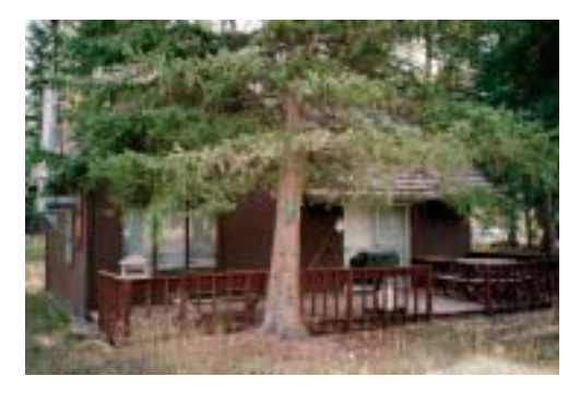
Cabins built in dense stands of lodgepole pine are a nightmare for fire management officers.

Part-time residents present the greatest challenge to neighborhoods working to reduce fuel loads. They have just a few weeks to enjoy their vacation homes, so clearing brush and trees is not a high priority for them. Getting permission from owners and leaseholders to clear around their cabins and funding fuel reduction programs are significant next steps. Using National Fire Plan grants, the DNRC Southern Land Office will pay $100 for each fire department-conducted home audit for fire danger; they also provide cost-share grants for individuals to create defensible space and serve as demonstration home sites.