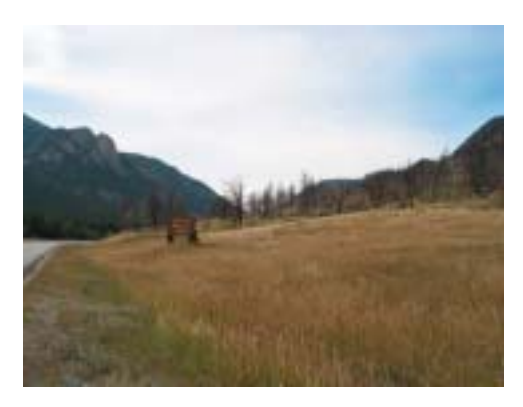
Red Lodge is located on the Beartooth Ranger District of the Custer National Forest.

Because the Custer National Forest is obligated to provide fire protection on Federal lands, its special use cabins, located in dense lodgepole pine, create nightmares for the Custer's Fire Management Officer. The Forest Service is designing a hazardous fuel reduction project to lessen the threat of wildfire to a number of recreation residence tracts, mapping defensible spaces around cabins, and seeking funding to reduce vegetation. Ninety cabin owners have been asked to participate in the risk-reduction project; so far, about 20 have shown interest.