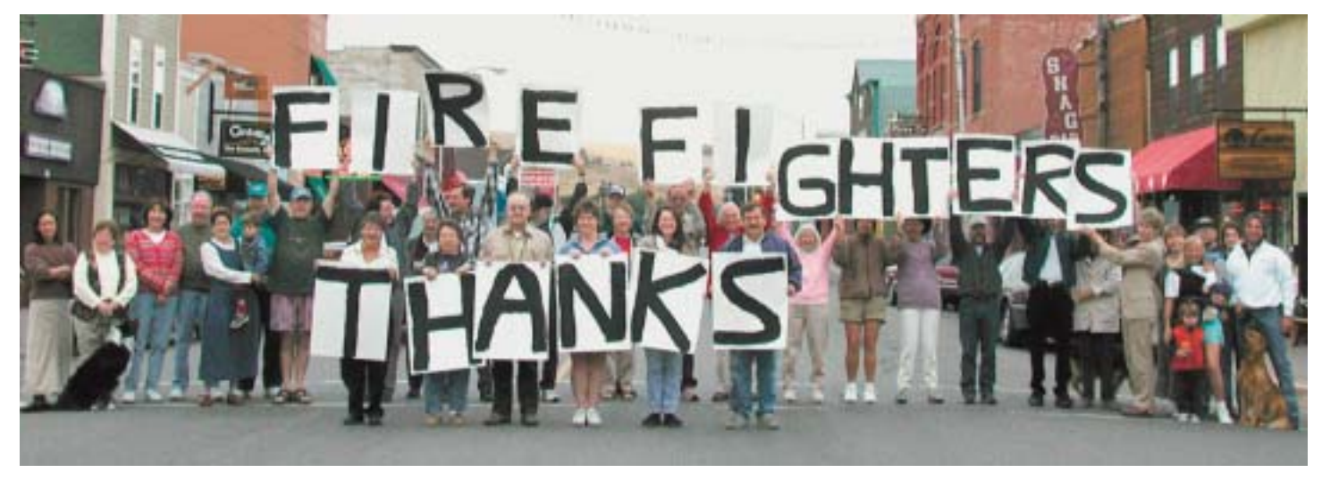
Local residents expressed their appreciation to firefighters following the Willie Fire.