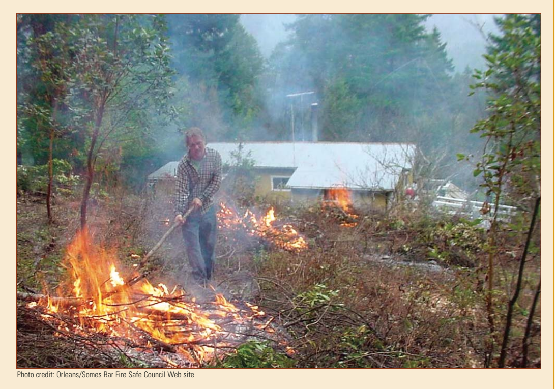
The Orleans/Somes Bar Fire Safe Council supports vegetation management by returning fire to the landscape, a tradition of Karuk tribal members living in northern California.

The communities of Orleans and Somes Bar are in a unique geographical area. Perhaps more than any other region in California, there is an opportunity for wildland fire use on a scale large enough to restore the area's historic fire regimes. The large expanses of unsettled forest lands surrounding these areas could act as a safety buffer to mitigate the related environmental and