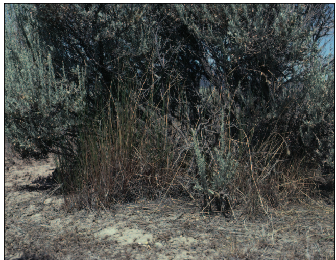
Figure 1 —A photo of a site where the only grass present is under the protective canopy of mature big sagebrush ( Artemisia tridentata ) plants (photo by Bruce L. Welch).

Daubenmire (1975, p. 31) states: “Field observations in Washington indicate that not only is there no allelopathic influence from this species of Artemisia ... but that it has a beneficial effect on other plants.” Wight and others (1992) describe one of these “beneficial effects on other plants” as being in the area of water conservation and extending water near the soil surface by 2 weeks versus interspaces between plants (see also Chambers 2001). They noted that big sagebrush canopies reduce solar radiation and prolong the period favorable for seedling establishment for perhaps as long as 28 days (also see Pierson and Wight 1991; and Chambers 2001 for favorable soil temperatures under big sagebrush). Hazlett and Hoffman (1975) studied the pattern of plant species placement in relation to big sagebrush distribution in western North Dakota. Their study site was dominated by big sagebrush that had a canopy cover value of 29 percent. They counted the number of established plants found in three concentric zones under and beyond the individual big sagebrush plant canopies. Number of established plants (most forbs, 18 species) in the inner zone