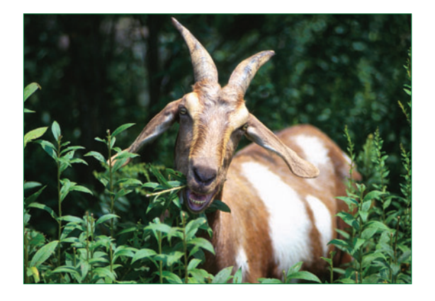
Figure 2—There are several options for treating understory vegetation, including biological means through targeted grazing; goats can be used to graze on palatable shrubs.